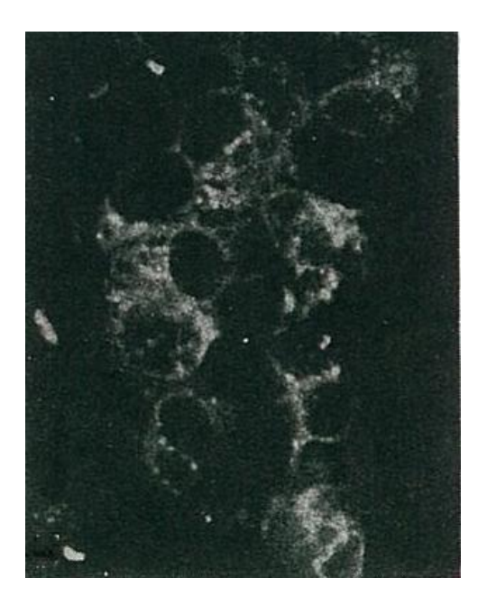
fluorescence antibody staining. Chimp liver cells were infected with recombinant vaccinia virus containing a HCV genome cDNA. After incubation for 48 hr, the cells were fixed with acetone and HCV NS5a protein was detected by indirect immunofluorescence staining using this antibody.

Fig.2 Detection of HCV NS5a protein by immuno-