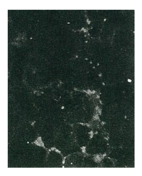
Fig.2 Detection of HCV NS5b protein by immunofluorescence antibody staining. Chimp liver cells were infected with recombinant vaccinia virus containing a HCV genome cDNA. After incubation for 48 hr, the cells were fixed with acetone and HCV NS5b protein was detected by indirect immunofluorescence staining using this antibody.

Fig.1 Western blotting of HCV NS5b protein. Chimp liver cells were infected with recombinant vaccinia virus containing a HCV genome cDNA and were subjected to Western blotting using this antibody. The NS5b protein is detected as a 58-kDa band.